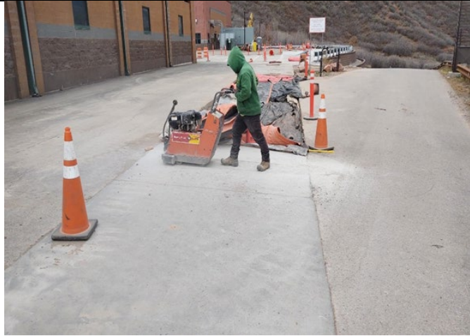
GMF Phase 2 Construction Activity