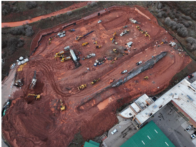
Aerial view of GMF Construction