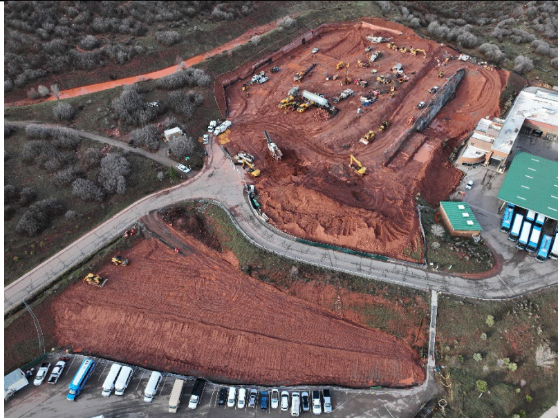
Aerial view of GMF Construction