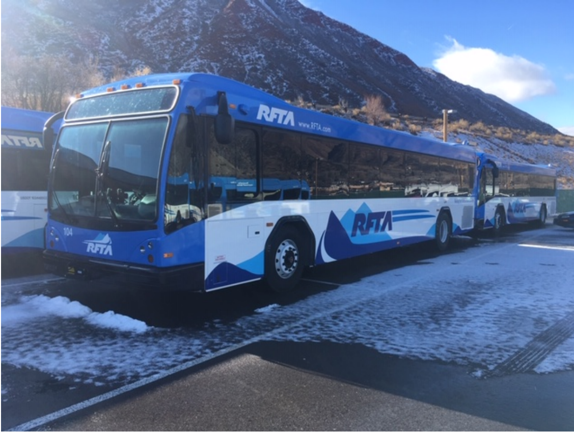
New 2019 Gillig Buses