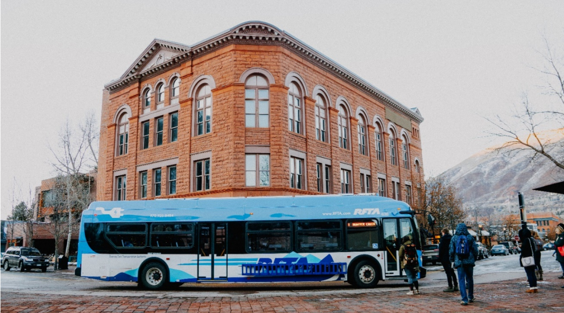
Battery electric bus on Hunter Creek Route December 3