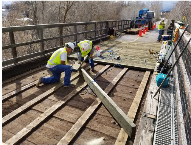
Workers completing deck repairs